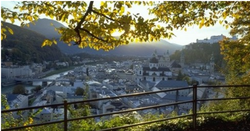
Blick vom Mönchsberg auf Festung und Altstadt, im Vordergrund die Universitätskirche, dahinter die Türme des Doms, der Franziskanerkirche, des Benediktiner-Stiftes St. Peter